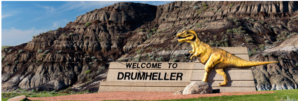
Town of Drumheller

Drumheller, Alberta, tucked in the Canadian Badlands , is a captivating small town that offers a distinctive lifestyle for those relocating for work. Located 135 kilometers northeast of Calgary, this community of about 8,000 residents combines stunning natural beauty, a rich historical backdrop, and a warm, welcoming atmosphere. Known for its rugged hoodoos, layered cliffs, and the Red Deer River valley, Drumheller is an ideal destination for professionals seeking opportunity in a scenic, affordable setting.